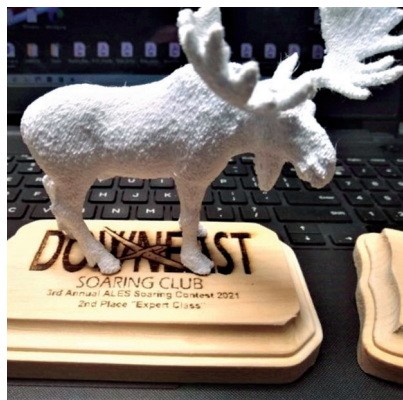
The Downeast Soaring Club's Moose Trophy Awards are for the annual ALES competition in Maine.