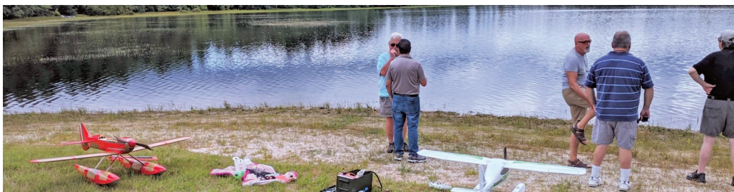
Come join with other fellow float fliers for the Bristol County RC Club's August 20, 2022, Annual John Nicolaci Memorial Float Fly on the beautiful 88-acre Mary's pond in Rochester MA.