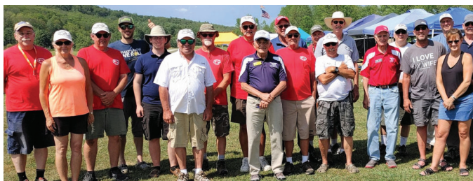
The group photo includes the club officers and members in red T-shirts whose efforts resulted in a great annual fun-fly for the pilots and the spectators who were given time to view the airplanes up close and ask questions.