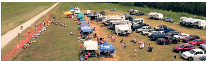
The Rutland County RC Flyers' site has 2,000 feet of unobstructed length with an 800-foot main grass runway, allowing any type and size of RC aircraft to be flown.